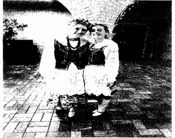
Members of Echoes of Poland participated in the procession