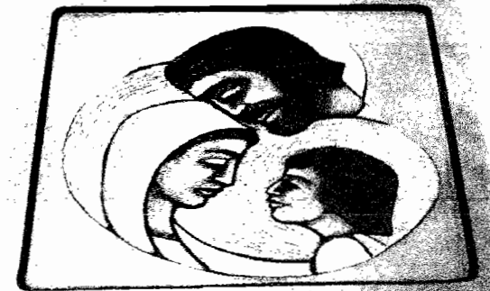
Silent auction item, one of many